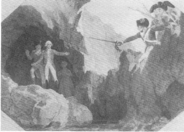
The arrest of Colclough and Harvey